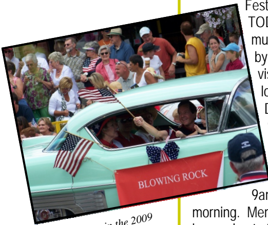
The Chamber in the 2009 parade.

million travelers taking a trip at least 50 miles away from home. Last year, 29.8 million Americans traveled during the same period. The 2010 Fourth of July holiday travel period is defined as Thursday, July 1 to Monday, July 5. Trips by automobile are expected to increase in popularity with 90 percent of travelers, or 31.4 million people, reaching their destination by driving. To find out more, click here and here .