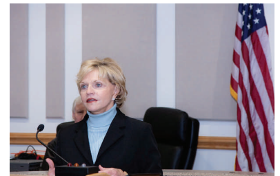
Governor Bev Perdue.