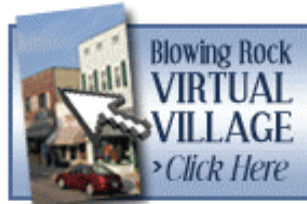
The Link to the Virtual Village on the BlowingRock.com website.

The Blowing Rock Chamber of Commerce and the Blowing Rock Tourism Development Authority have teamed up with Codelt Design, Inc. to develop a virtual tour of Blowing Rock which will allow users of the BlowingRock.com website to tour the Village at street level. The Virtual Village has now been linked to the web site. You'll see the icon under the changing pictures on the right. Click on the Virtual Village tab. As a user clicks through the panoramic photographs of the village, by following the BR icon, they are able to move up and down streets, and even enter participating shops and businesses. This will make Blowing Rock one of the few small towns in the nation that offer this feature to