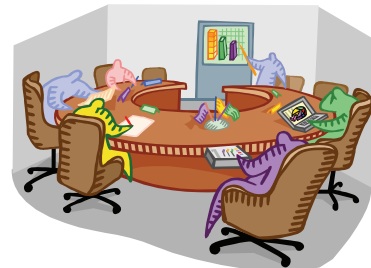
Members of the Board of Directors are elected to two year terms.

of the proposed 2009 budget and several committee reports. Chamber committees are working on a range of issues from developing a steering committee for a proposed Wine & Culinary Institute to the development of new events and other economic development for Blowing Rock.