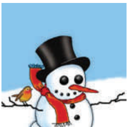
Winterfest is on its way. Look at that Frosty go!

Glidewell's is located at 1128 South Main Street.