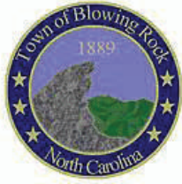
The town of Blowing Rock would appreciate your time.