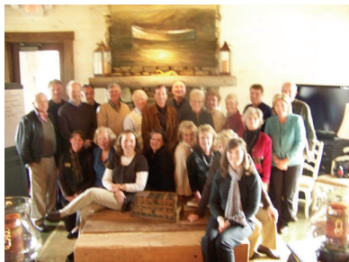
Members of the Blowing Rock Chamber Board Of Directors.