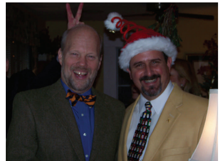
Look out Cobb! Someone hit the naughty list... and it's not even Jimmy!