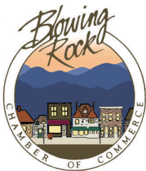
The Blowing Rock Chamber is the oldest Chamber in the High Country, founded in 1927.

Chamber designs and executes many events in the town of Blowing Rock which stimulate the economy. If you have not yet made your dues investment for 2009, please do so very soon. Remember that your listing in the upcoming 2010 - 2011 Directory will be jeopardized if your dues investment is not made by January 1, 2010.