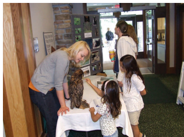
A scene from spring's Concierge 101.

Ours is a place that prides its self on having lots to do for our visitors — from tourists to our grandkids. Everyday in Blowing Rock, someone asks an employee or a friend or family member in our town one simple question: “What is there to do in this town?” In order to help everyone know the answer to this the Blowing Rock Chamber has developed a pair of annual events. Our tourism related version of a business expo; we call this event CONCIERGE 102, and we want YOU to be there to educate the public and village employees about your fun things for folks to do! The more people know about your products and services, the more they will tell other people about it. Concierge 102, will