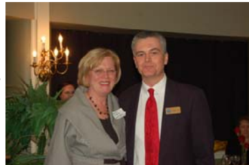
Outstanding Outdoor Display went to Shops at the Martin House