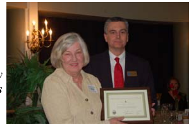
Outstanding Window Display went to Finley House Antiques