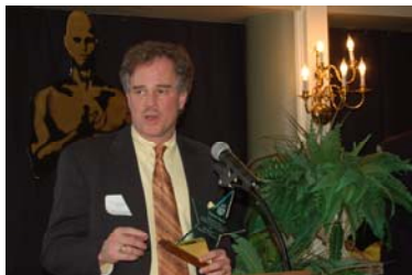
Chetola was presented with a lifetime achievement award for their Christmas Decorations