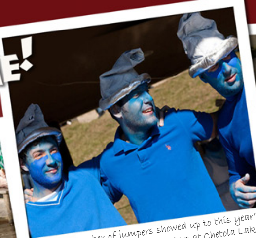
A record number of jumpers showed up to this year's Polar Plunge to brave the cold waters at Chetola Lake. Many of the jumpers dressed up in costume.